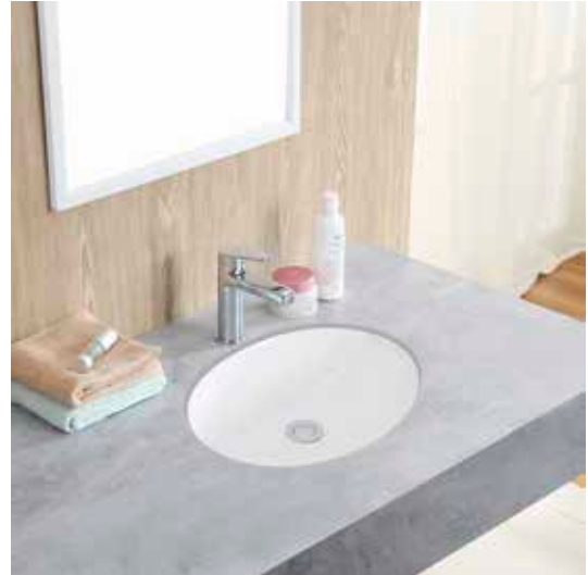
Installed Product Image

Please note: All porcelain sinks are fired at a very high temperature; final dimensions may vary slightly.